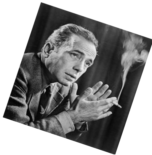
Humphrey Bogart (Bogie)-Scotch & Gin Martini "I should never have switched from scotch to martinis."