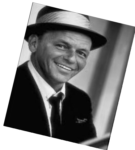
Frank Sinatra-Jack Daniels Tennessee Whiskey & Water "This is a gentleman's drink," is how he described it. "This is nice." He called it "The Black Ass of Jack Daniel," on occasion.

Deep Fried Chicken Tenders, served with Ranch Dressing 7.95