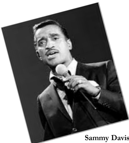
Sammy Davis Jr.—Stinger Should be pronounced with a decidedly Sammy Davis Jr. accent, i.e. "Stingahhhh baby."