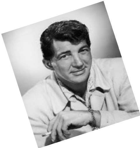
Dean Martin-Scotch & Gin Martini "If you drink, don't drive. Don't even putt."

Seasoned Wings with Carrots, Celery & Ranch Dressing 8.95