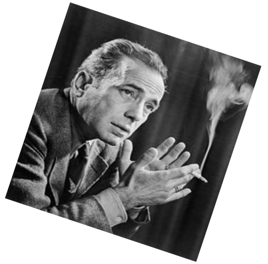
Humphrey Bogart (Bogie)-Scotch & Gin Martini "I should never have switched from scotch to martinis."