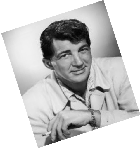
Dean Martin-Scotch & Gin Martini "If you drink, don't drive. Don't even putt."

Spicy Chicken with Bell Peppers, Onions and Cheese Served with Sour Cream & Salsa 10.14