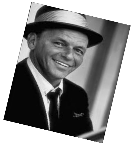
Frank Sinatra-Jack Daniels Tennessee Whiskey & Water "This is a gentleman's drink," is how he described it. "This is nice." He called it "The Black Ass of Jack Daniel,"