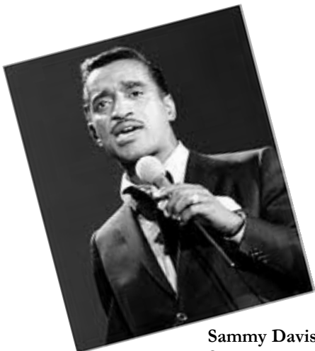
Sammy Davis Jr.—Stinger Should be pronounced with a decidedly Sammy Davis Jr. accent, i.e. "Stingahhhh baby."