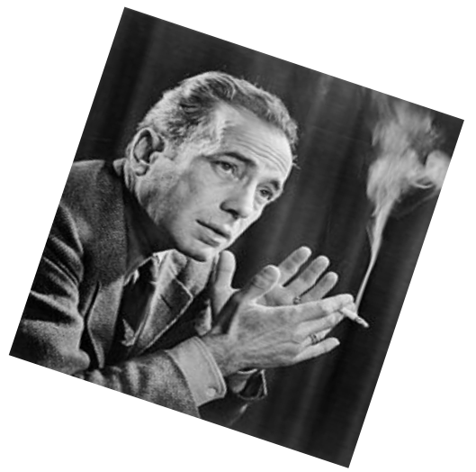
Humphrey Bogart (Bogie)-Scotch & Gin Martini "I should never have switched from scotch to martinis."