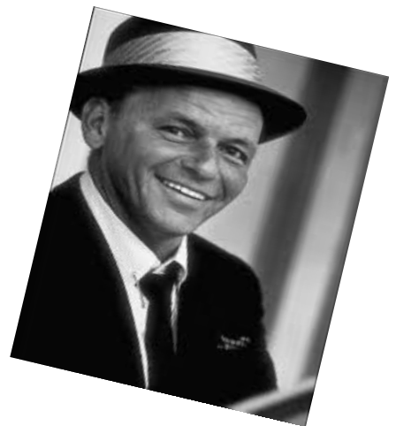
Frank Sinatra-Jack Daniels Tennessee Whiskey & Water "This is a gentleman's drink," is how he described it. "This is nice." He called it "The Black Ass of Jack Daniel,"