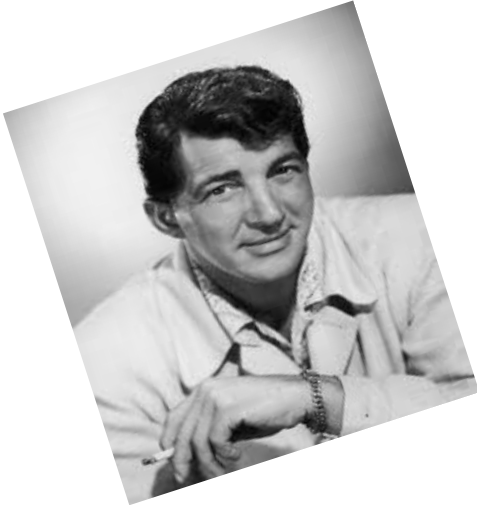
Dean Martin-Scotch & Gin Martini "If you drink, don't drive. Don't even putt."

Spicy Chicken with Bell Peppers, Onions and Cheese Served with Sour Cream & Salsa 11.07