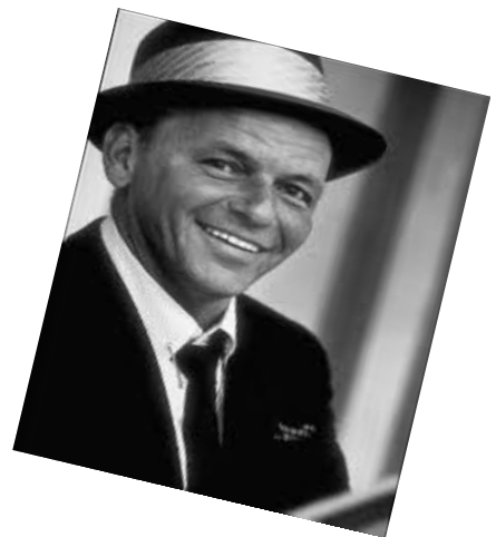
Frank Sinatra-Jack Daniels Tennessee Whiskey & Water "This is a gentleman's drink," is how he described it. "This is nice." He called it "The Black Ass of Jack Daniel,"