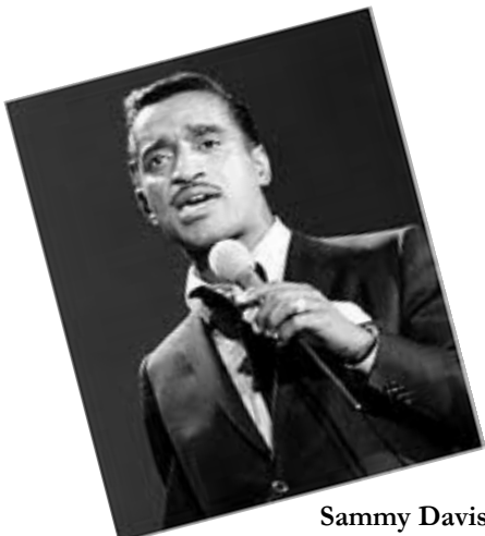
Sammy Davis Jr.—Stinger Should be pronounced with a decidedly Sammy Davis Jr. accent, i.e. "Stingahhhh baby."

Humphrey Bogart (Bogie)-Scotch & Gin Martini "I should never have switched from scotch to martinis."