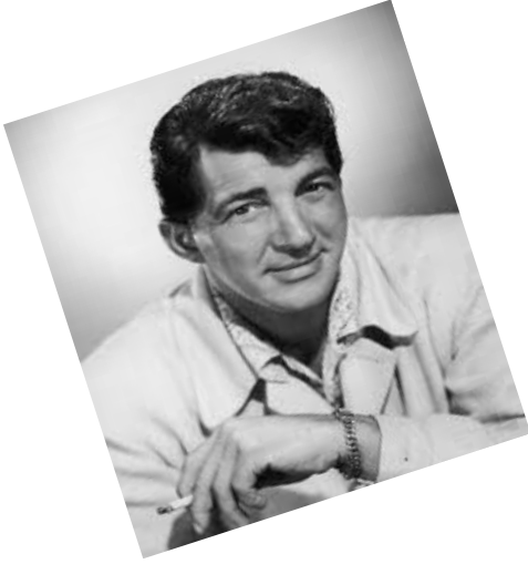
Dean Martin-Scotch & Gin Martini "If you drink, don't drive. Don't even putt."

Spicy Chicken with Bell Peppers, Onions and Cheese Served with Sour Cream & Salsa 13.84