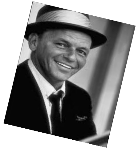
Frank Sinatra-Jack Daniels Tennessee Whiskey & Water "This is a gentleman's drink," is how he described it. "This is nice." He called it "The Black Ass of Jack Daniel,"