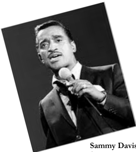
Sammy Davis Jr.—Stinger Should be pronounced with a decidedly Sammy Davis Jr. accent, i.e. "Stingahhhh baby."