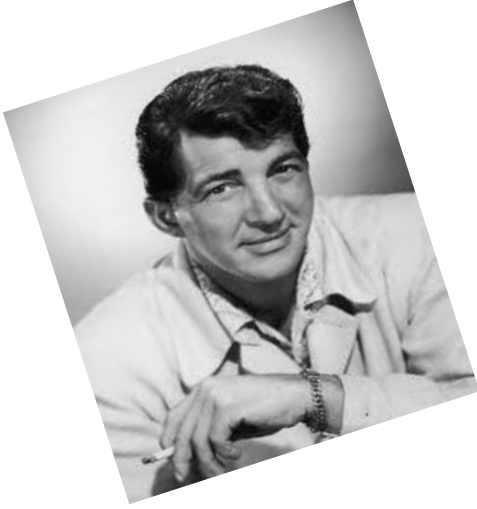
Dean Martin-Scotch & Gin Martini "If you drink, don't drive. Don't even putt."

Spicy Chicken with Bell Peppers, Onions and Cheese Served with Sour Cream & Salsa 13.84