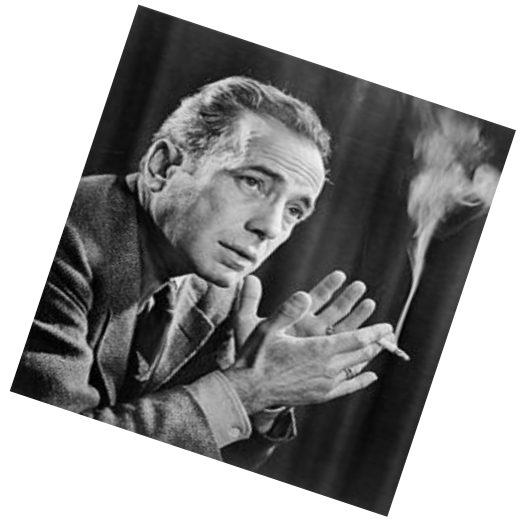
Humphrey Bogart (Bogie)-Scotch & Gin Martini "I should never have switched from scotch to martinis."