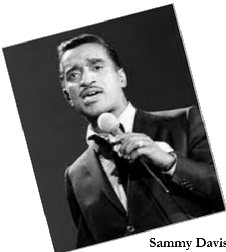
Sammy Davis Jr.—Stinger Should be pronounced with a decidedly Sammy Davis Jr. accent, i.e. “Stingahhhh baby.”