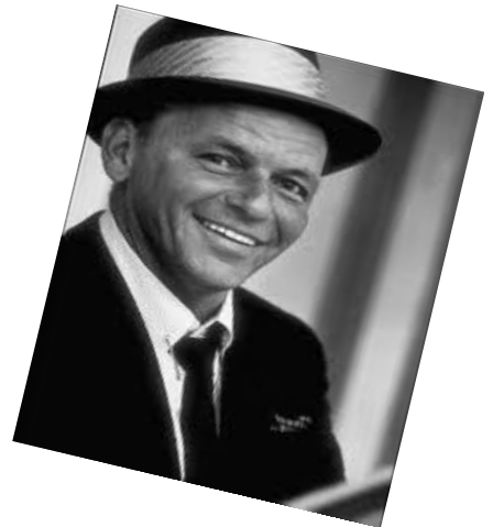
Frank Sinatra-Jack Daniels Tennessee Whiskey & Water “This is a gentleman’s drink,” is how he described it. “This is nice.” He called it “The Black Ass of Jack Daniel,”